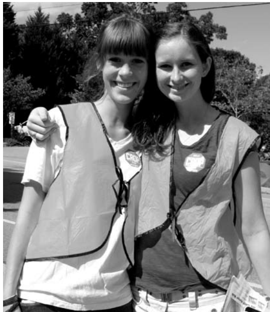
All who appear in the photos in this brochure have signed a release permitting the use their photographs in CCC publications.