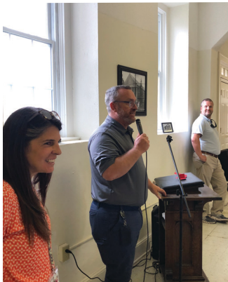
Area school leaders give presentations during a back to school workshop.

For many years, CCC has partnered with the schools in our service area to offer back to school workshops for our client parents and children. School principals and guidance counselors share with our families and answer questions about bus routes, school feeding programs, attendance and scheduling. This program allows our families to begin school with all the information needed to get the year off to a great start.