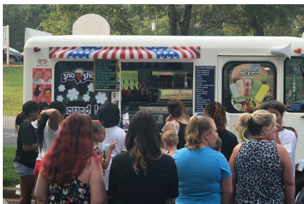
Workshop attendees enjoyed ice cream after the presentations and dinner.

Participating families receive a backpack for each child filled with school supplies. Each backpack is individually packed based on the specific supply list provided by the child's grade and school. With your help, CCC was able to provide 195 backpacks for students in August. We appreciate school personnel taking time during a busy season to spend an evening with our families and share information.